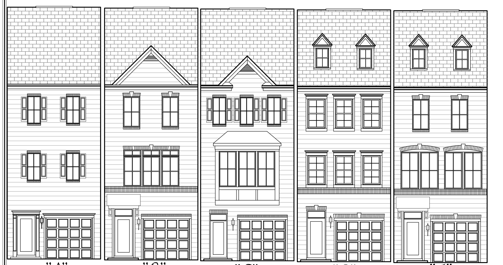
(Lots 94-91 & 111-118) (Clarendon - Front Load) FRONT ELEVATION NO SCALE