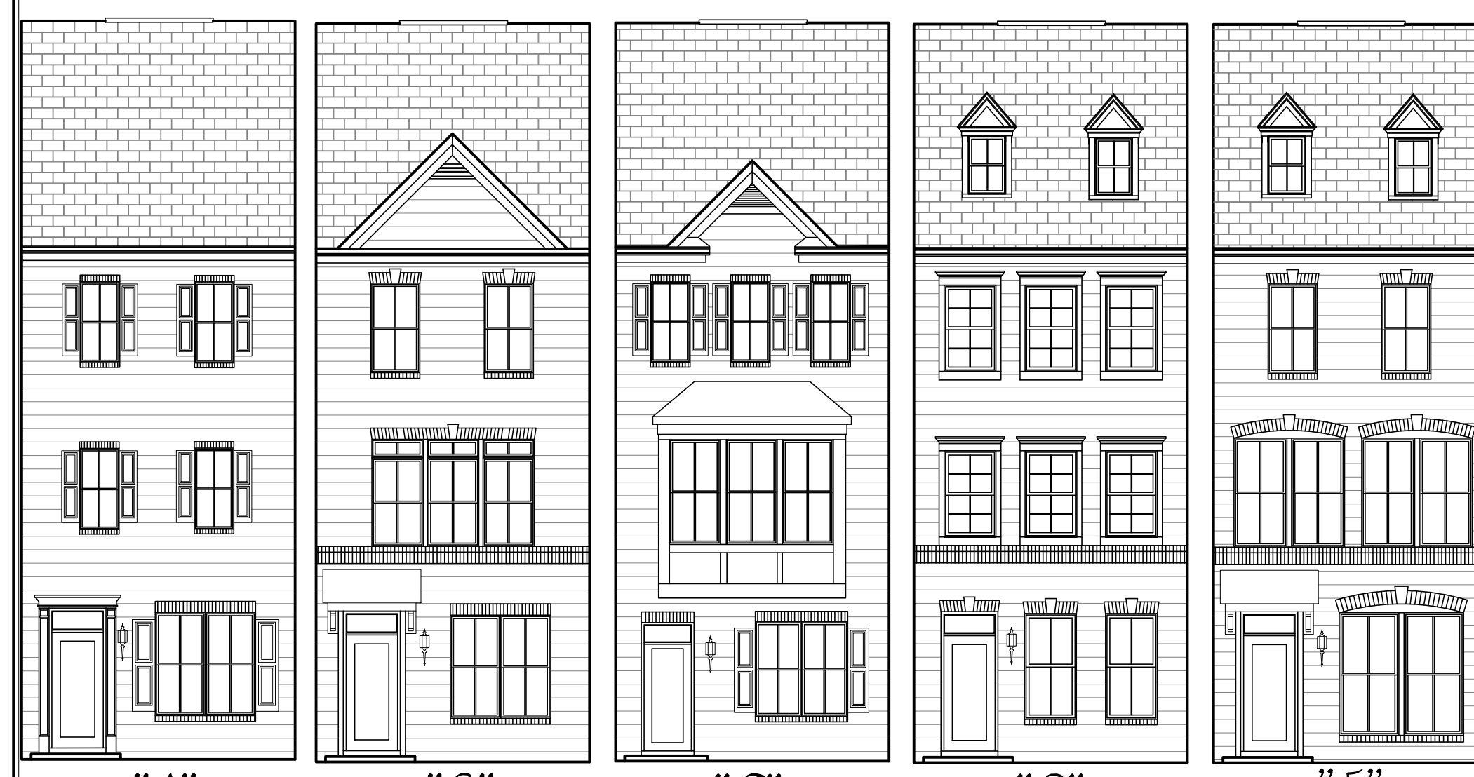
(Clarendon - Rear Load) FRONT ELEVATION NO SCALE