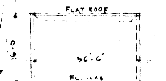
SCHEMATIC CROSS SECTION ON MAX. BUILDING HEIGHT