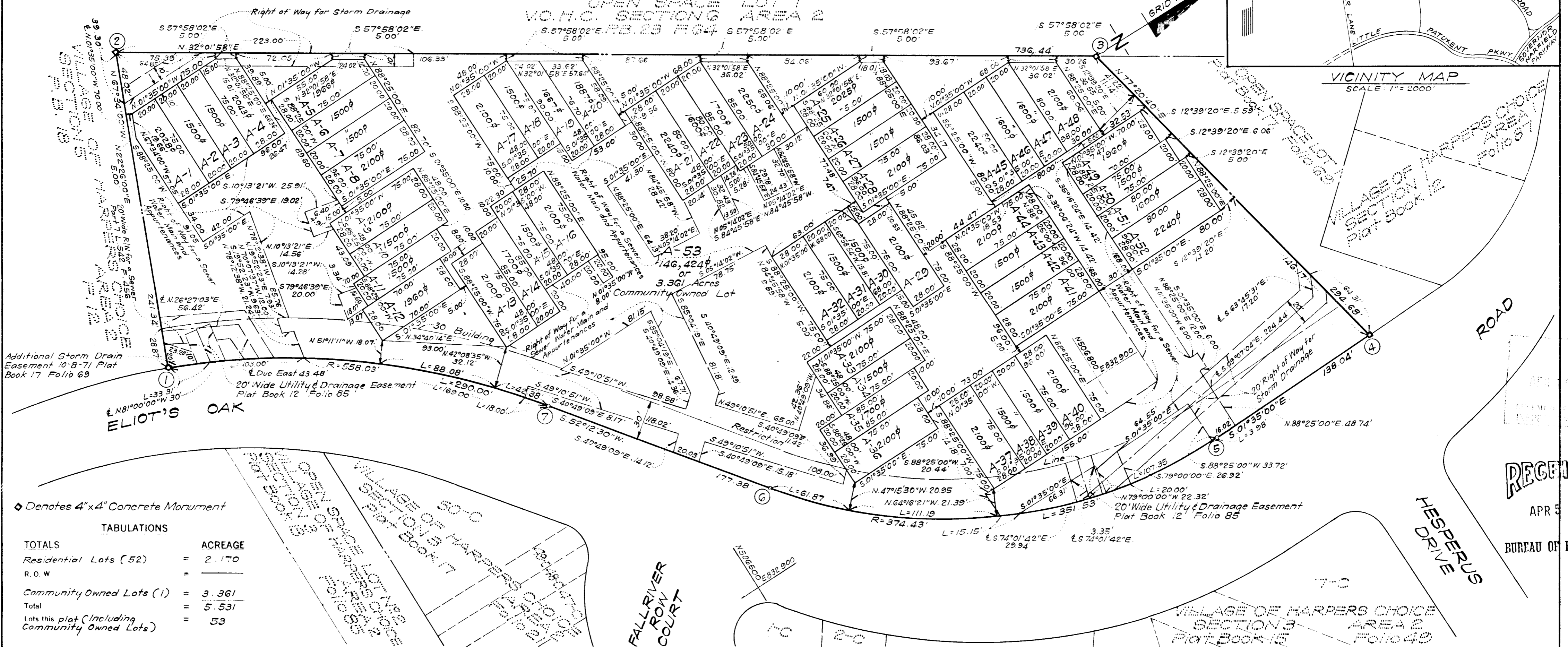
VICINITY MAP SCALE: 1" = 2000'

OPEN SPACE LOT 1 V.O.H.C. SECTION 5 AREA 2 P.B. 26