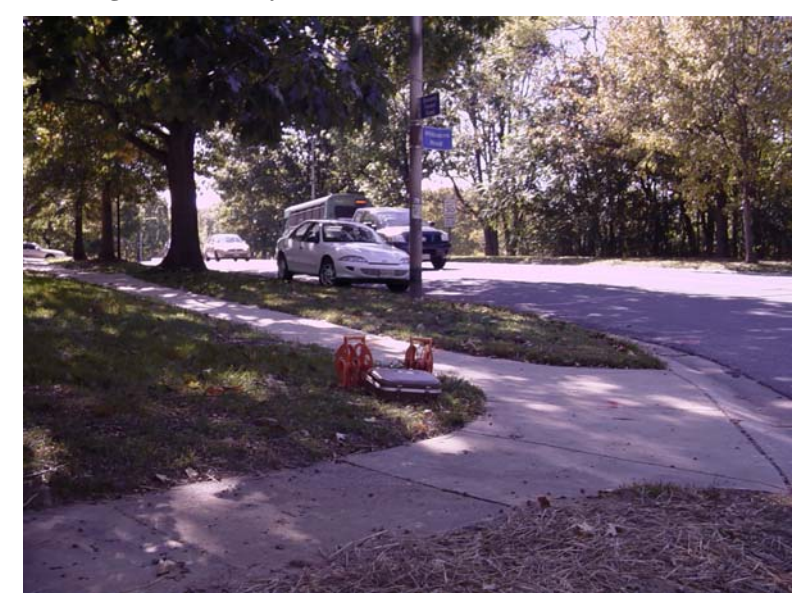
Figure 88 – Measuring stray currents at the location Whiteacre Road 2