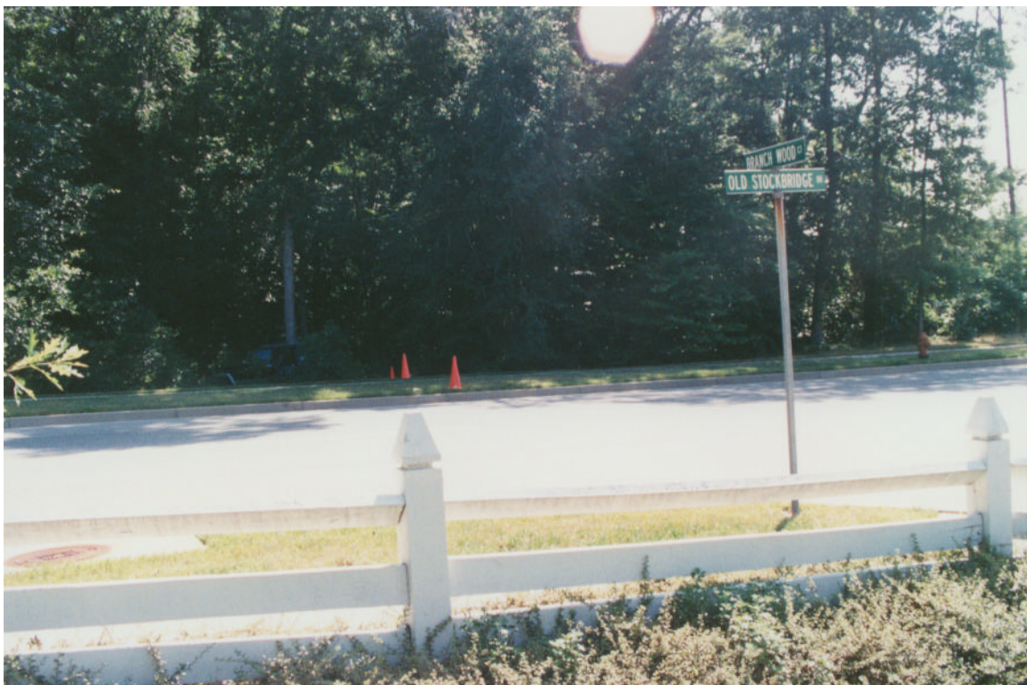
Figure 11. Location of Site 12