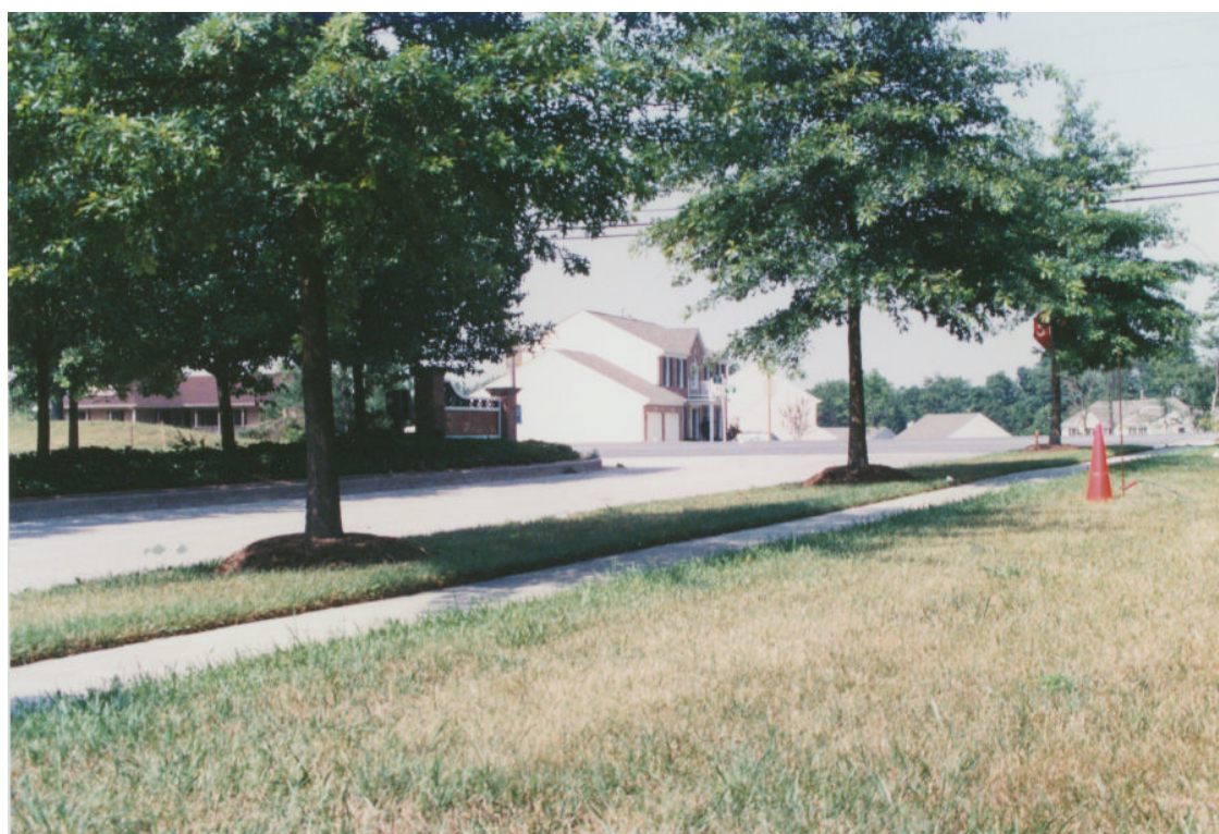
Figure 12. Location of Site 13