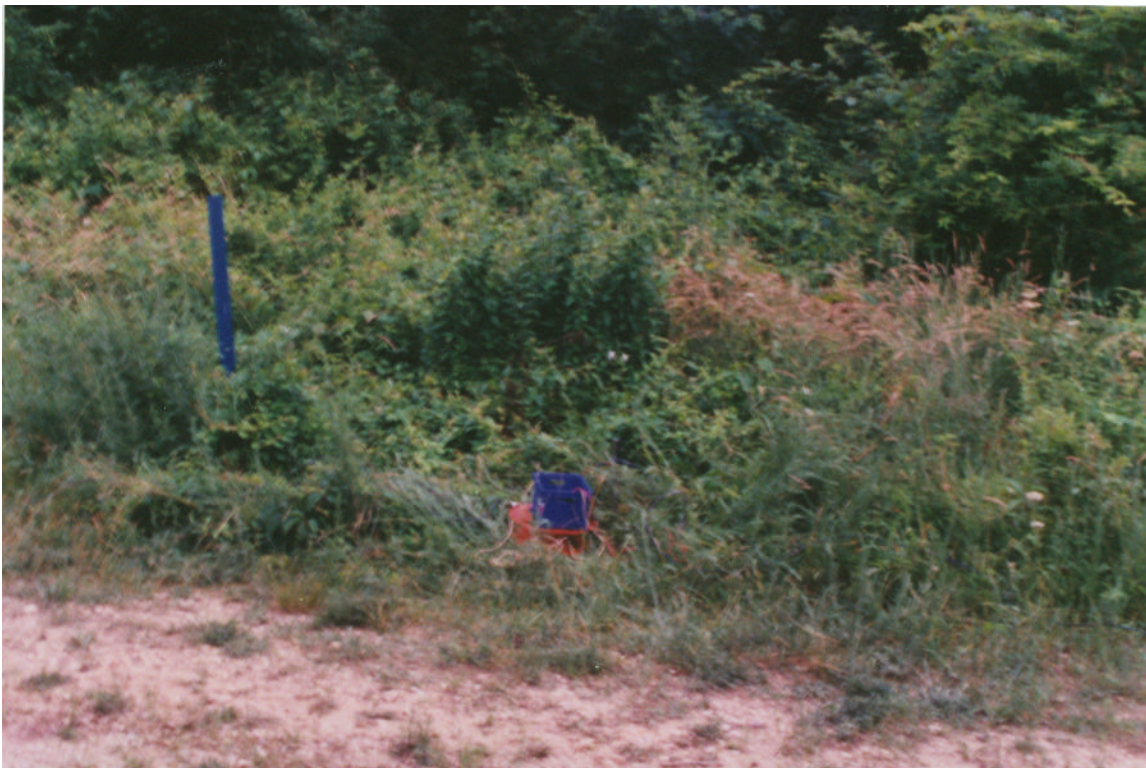
Figure 7. Location of Site 7