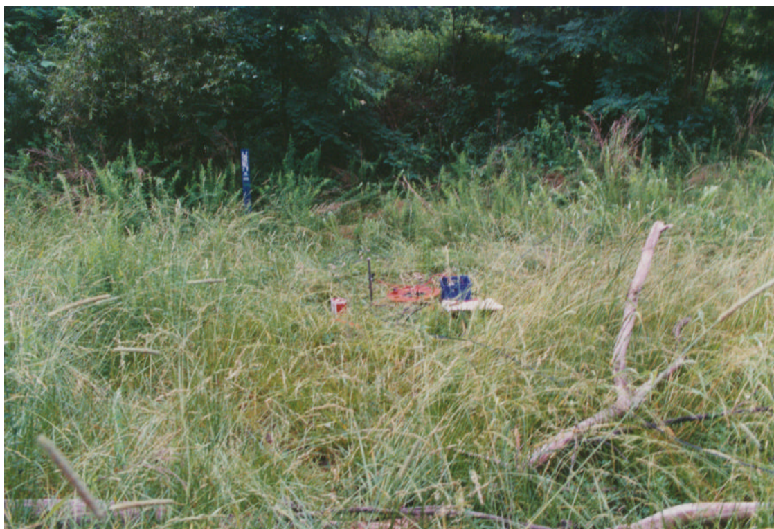
Figure 8. Location of Site 9