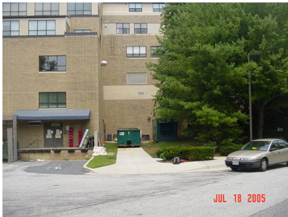
Figure 81 - Impressed Current Rectifier ST14