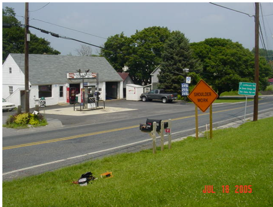
Figure 69 - Impressed Current Rectifier ST8