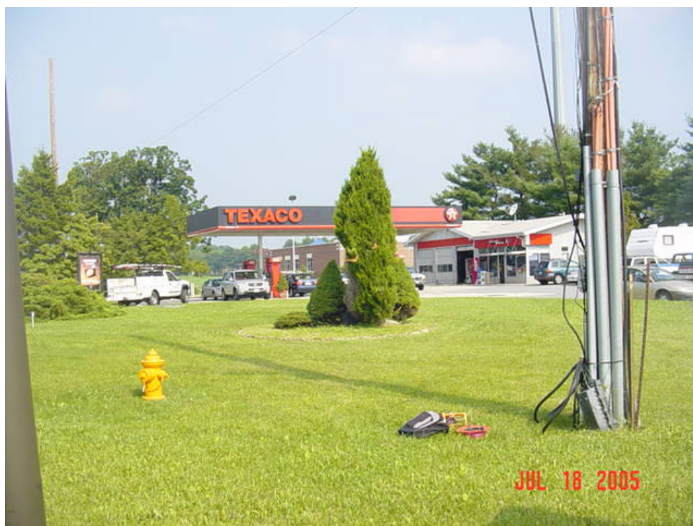
Figure 59 - Impressed Current Rectifier ST3