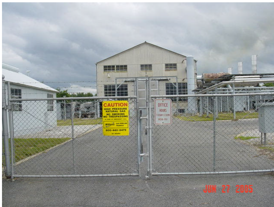
Figure 38 - Impressed Current Rectifier TR3