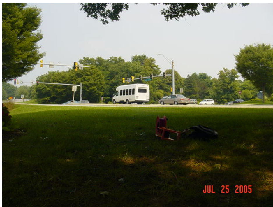
Figure 121 – Measuring stray currents near Route 175 and Thunder Hill Road