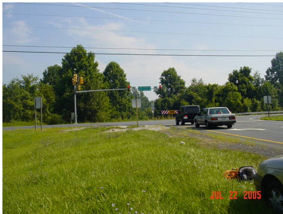
Figure 115 – Measuring stray currents near Route 29 and Route 99