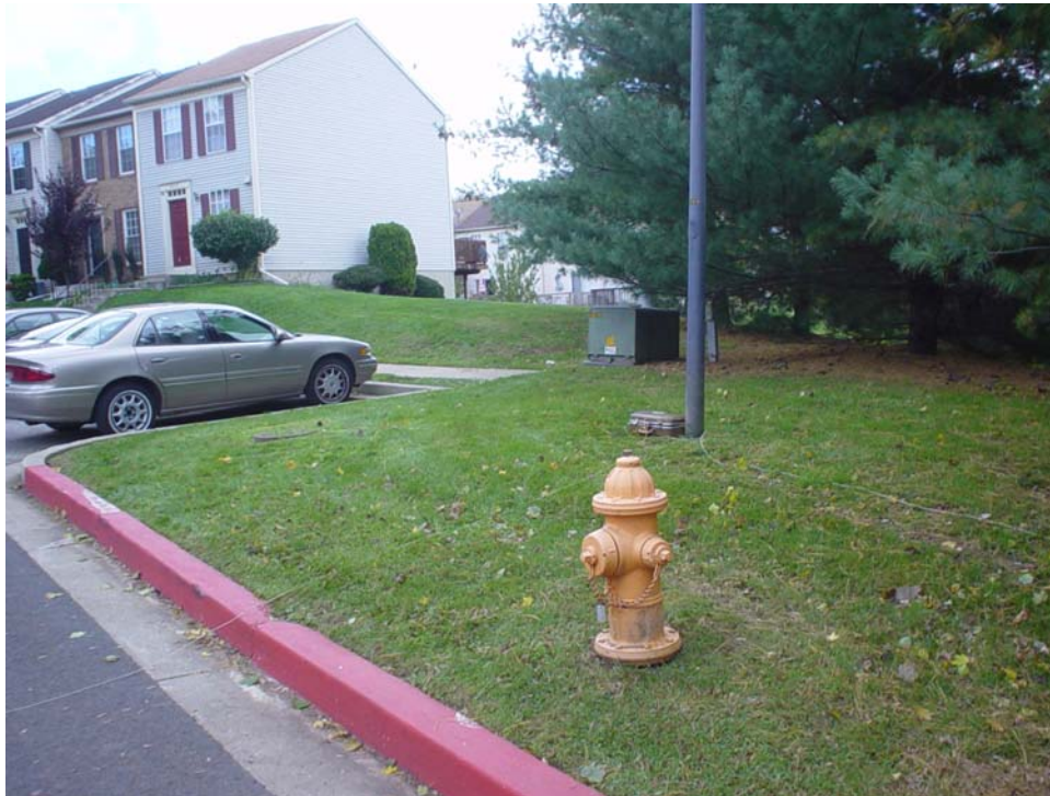
Figure 38 - Stray Current Testing in Marble Hill (Branch F)