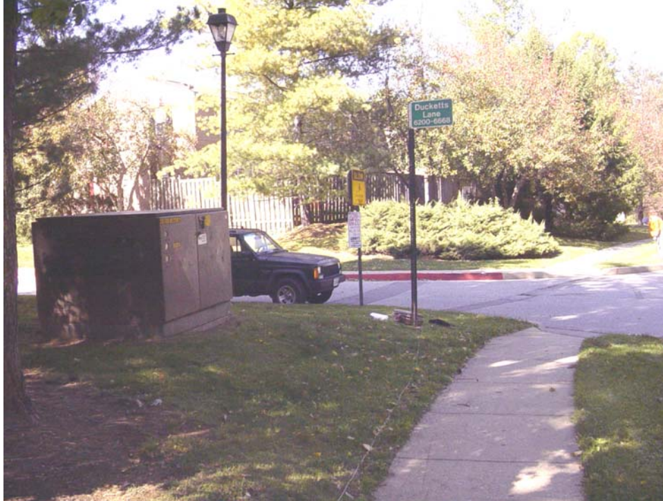
Figure 32 - Stray Current Testing on Ducketts Lane and Marble Hill Entrance