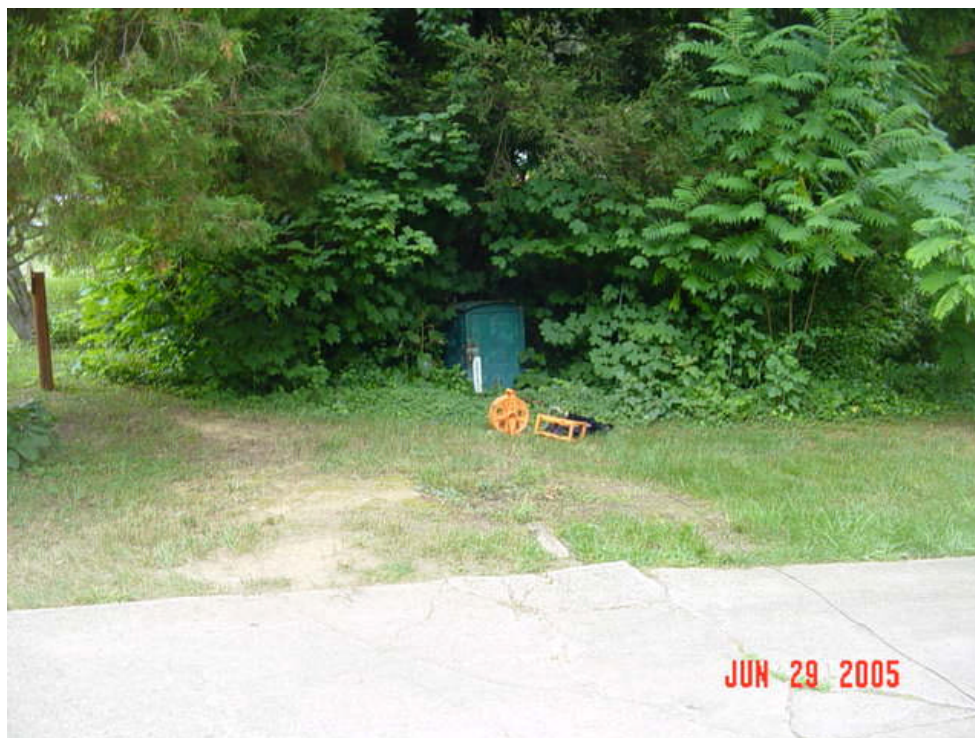
Figure 49 - Impressed Current Rectifier COL2