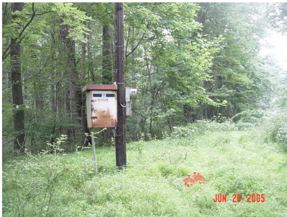
Figure 46 - Impressed Current Rectifier COL1