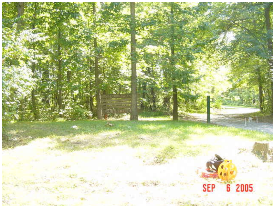
Figure 111 – Ten Oaks stray current location