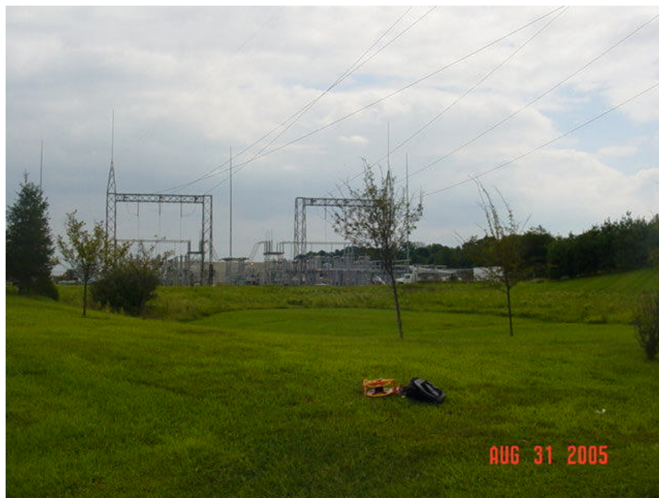
Figure 109 – Snowden River substation