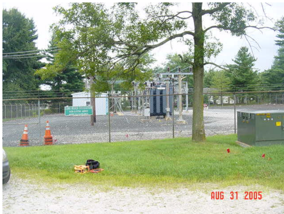
Figure 107 – Long Reach substation