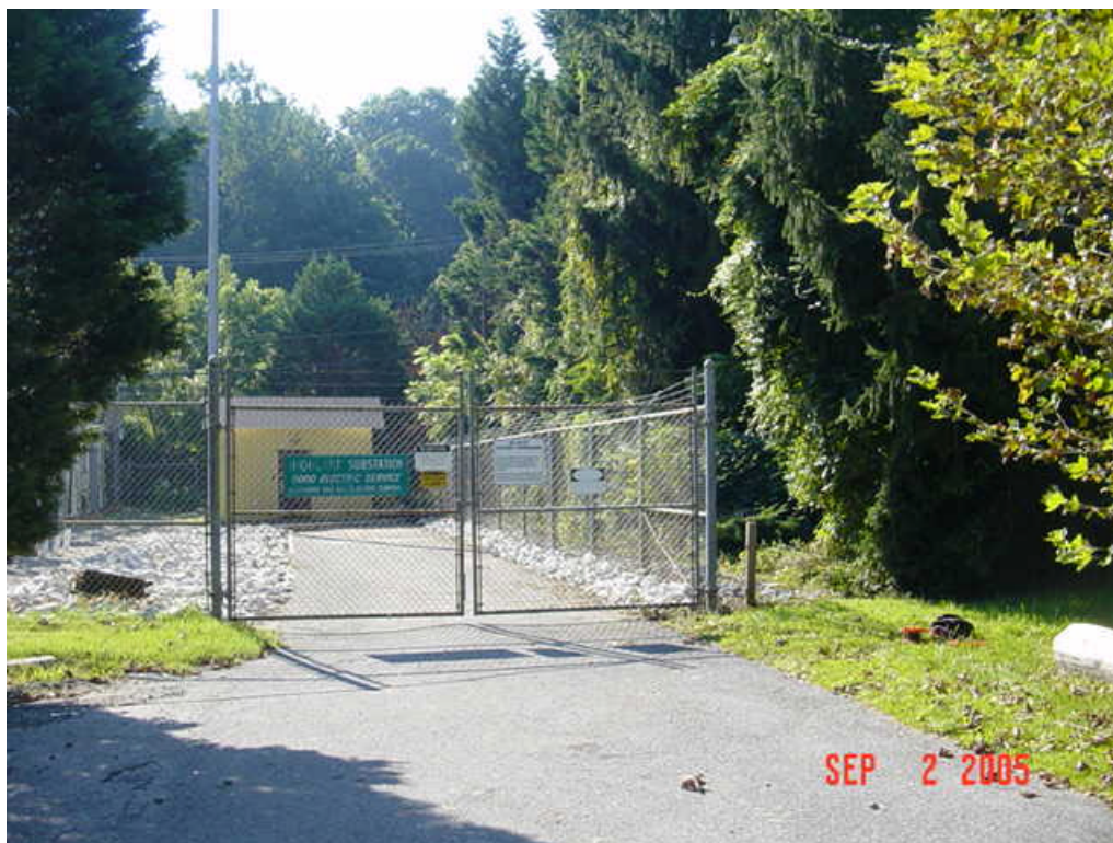
Figure 99 – Highland substation