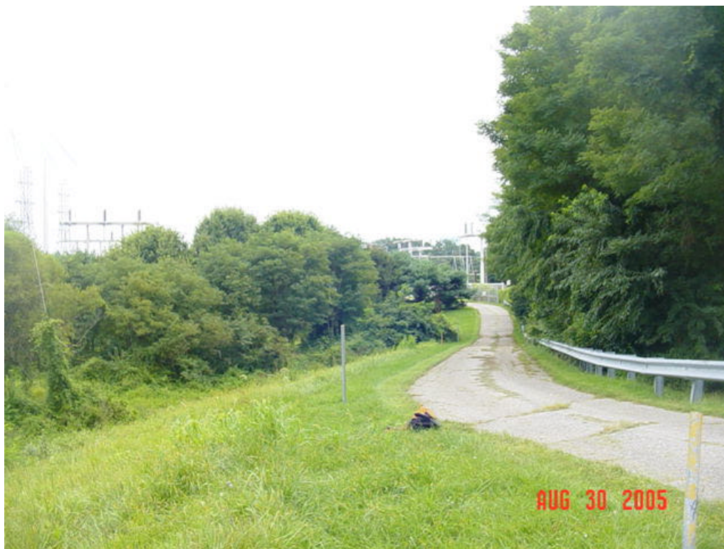
Figure 89 – Columbia substation