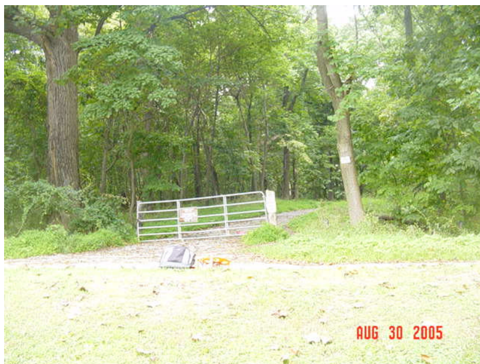
Figure 87 - Picture of the stray current testing location for the Chestnut Hill substation