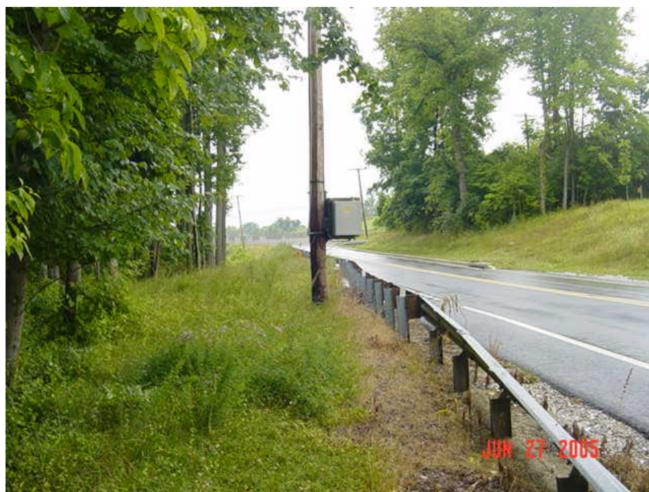
Figure 25 - Impressed Current Rectifier BGE8