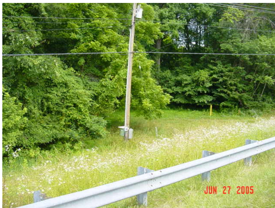
Figure 23 - Impressed Current Rectifier BGE7