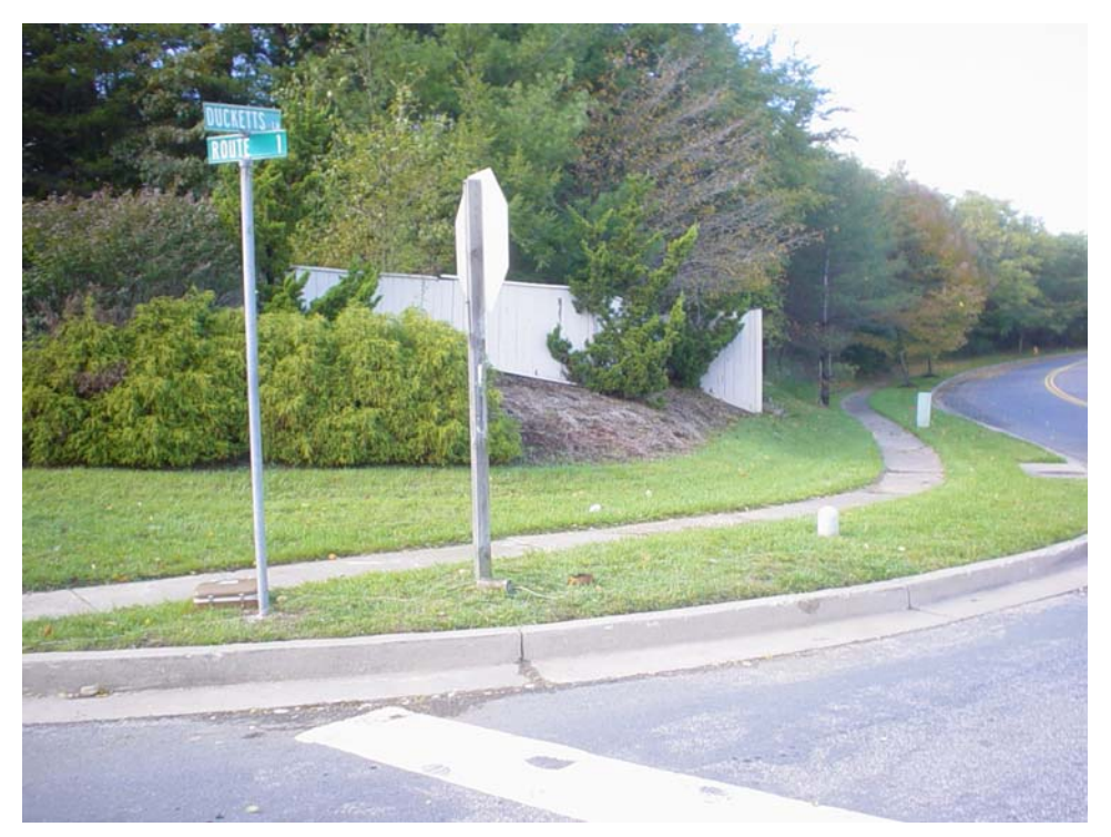
Figure 30 - Stray Current Testing on Ducketts Lane and U.S. Route 1