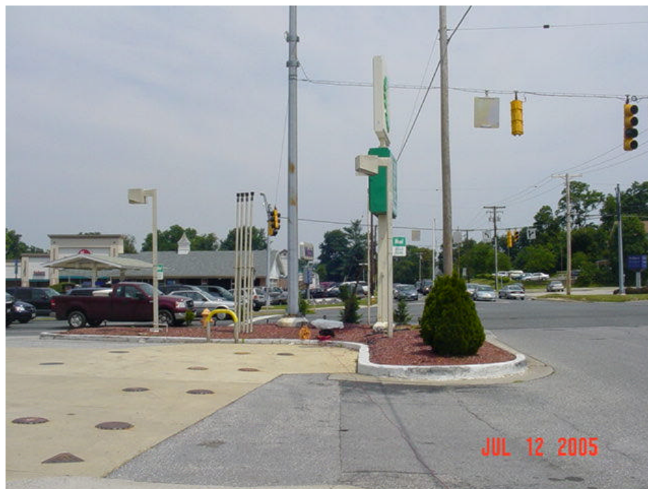
Figure 71 - Impressed Current Rectifier ST9