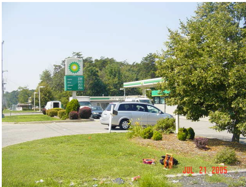
Figure 63 - Impressed Current Rectifier ST5