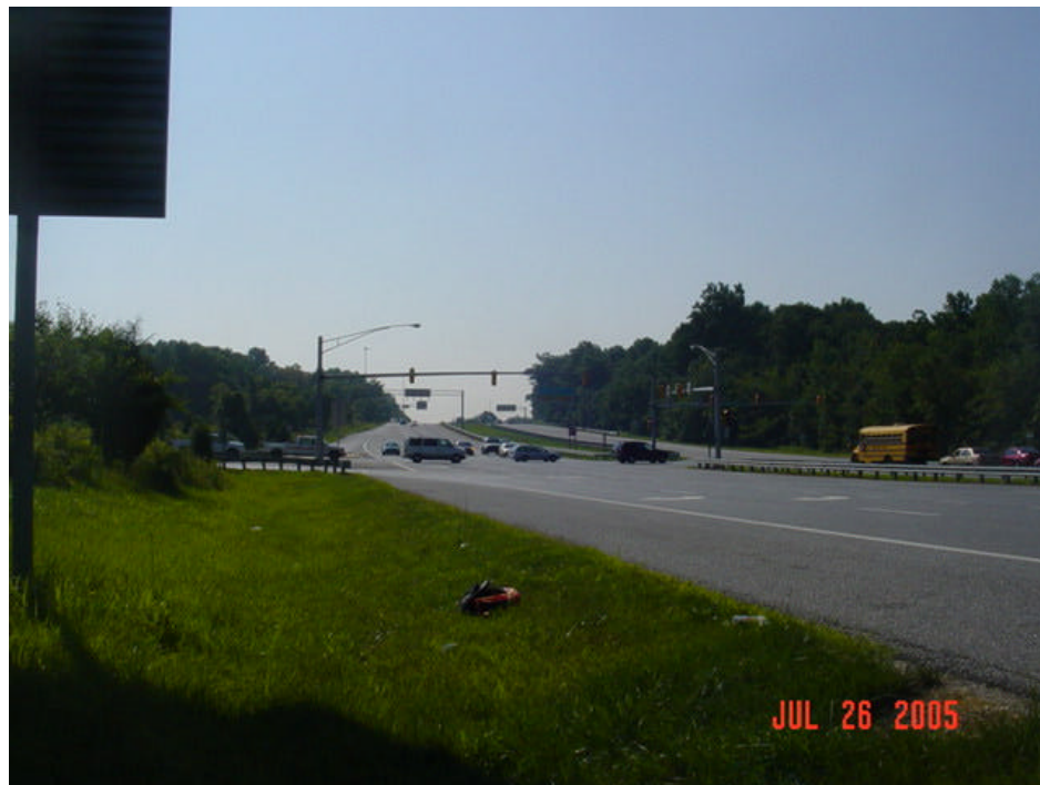
Figure 125 – Measuring stray currents near Route 175 and Route 108