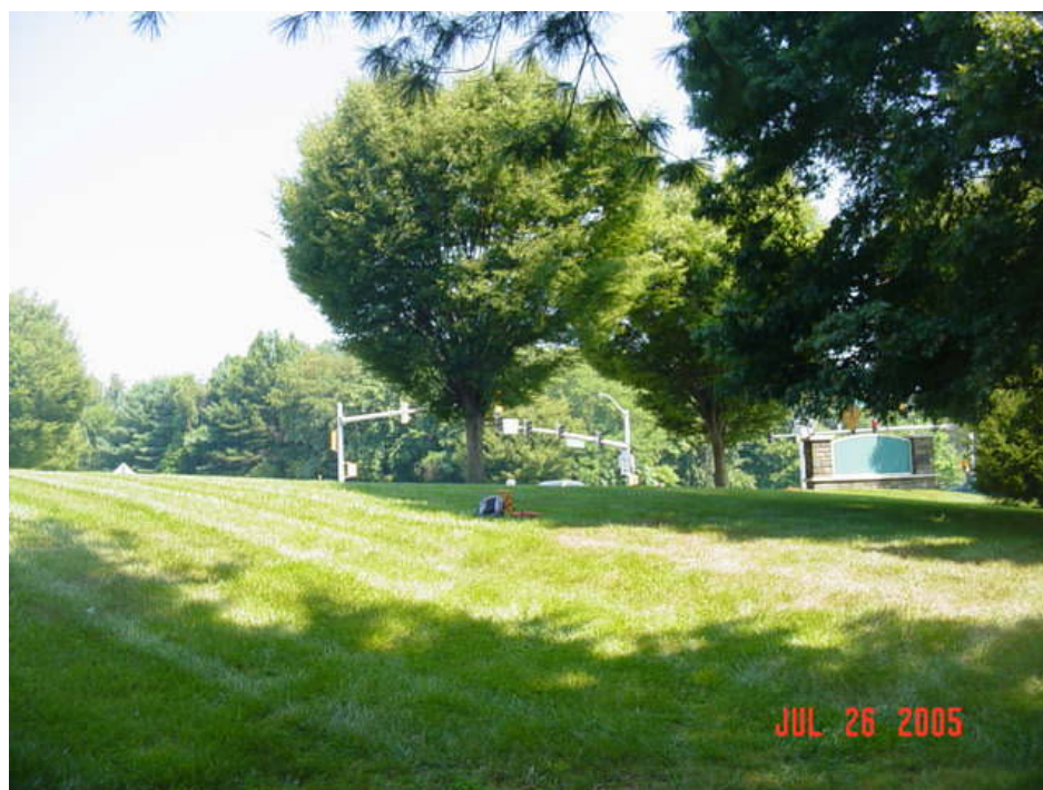
Figure 123 – Measuring stray currents near Route 175 and Tamar Drive