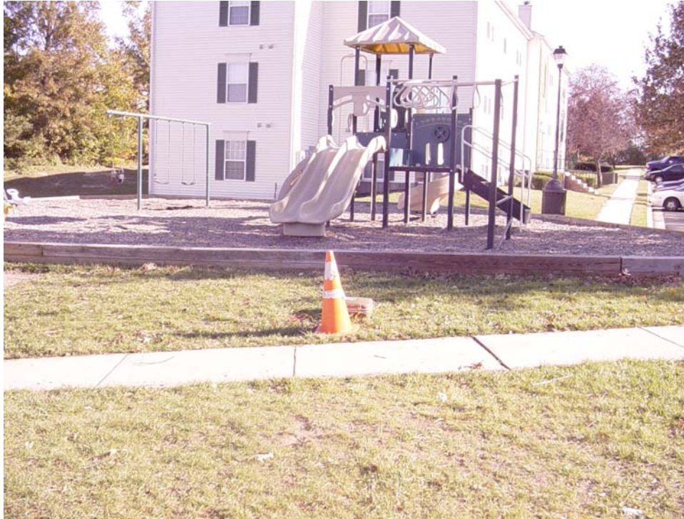
Figure 36 - Stray Current Testing in Pine Ridge Community

One (1) stray current measurement was taken in the Pine Ridge community, close to where the service pipe branches off, shown in Figure 36. The results are shown in Figure 37.