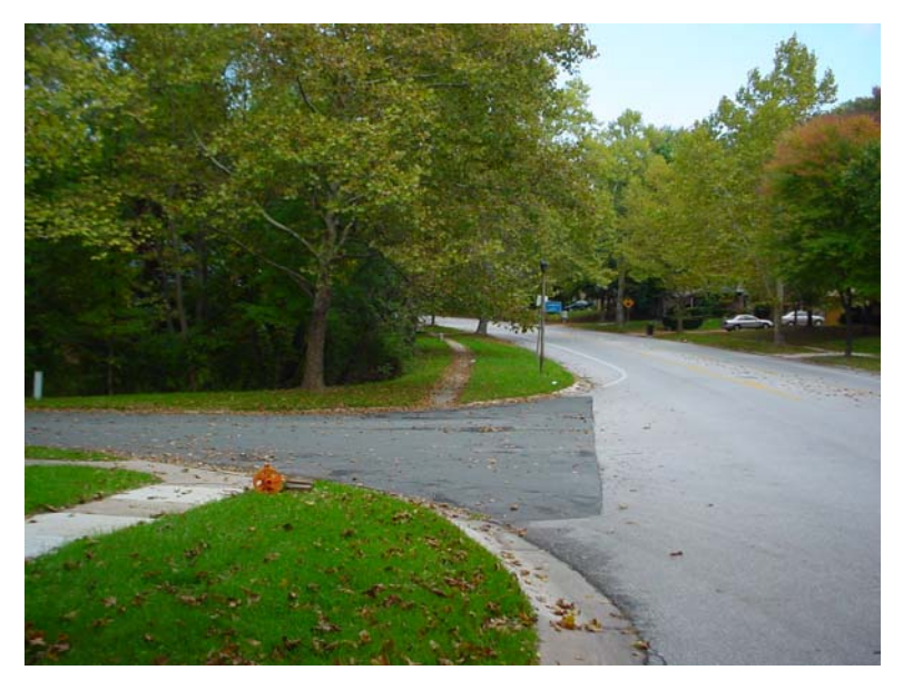
Figure 84 – Measuring stray currents at the location Long Look Lane 2