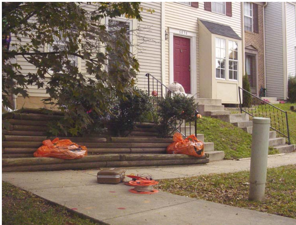
Figure 44 - Stray Current Testing in Marble Hill (Branch A)