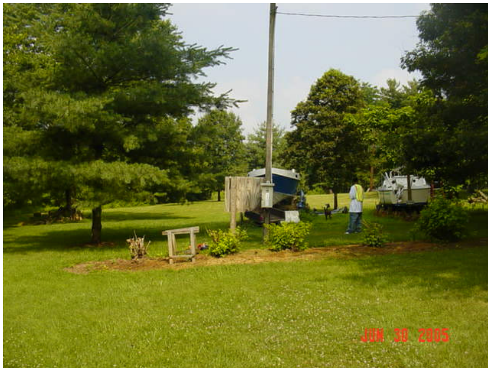
Figure 52 - Impressed Current Rectifier COL3