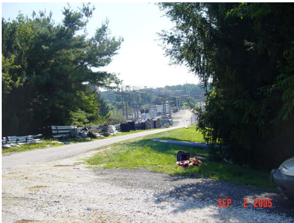
Figure 101 - High Ridge substation