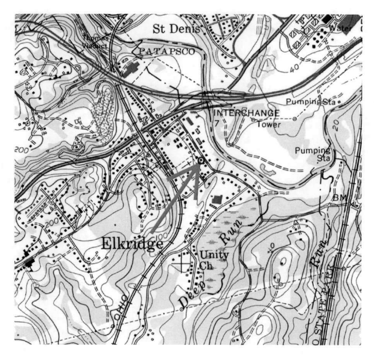
HO-973 Schoneman Single Tenant House 5674 Furnace Avenue Elkridge Relay Quad