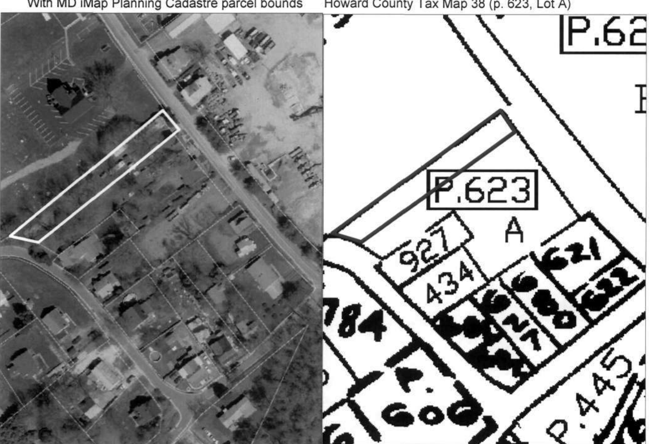
Howard County Tax Map 38 (p. 623, Lot A)