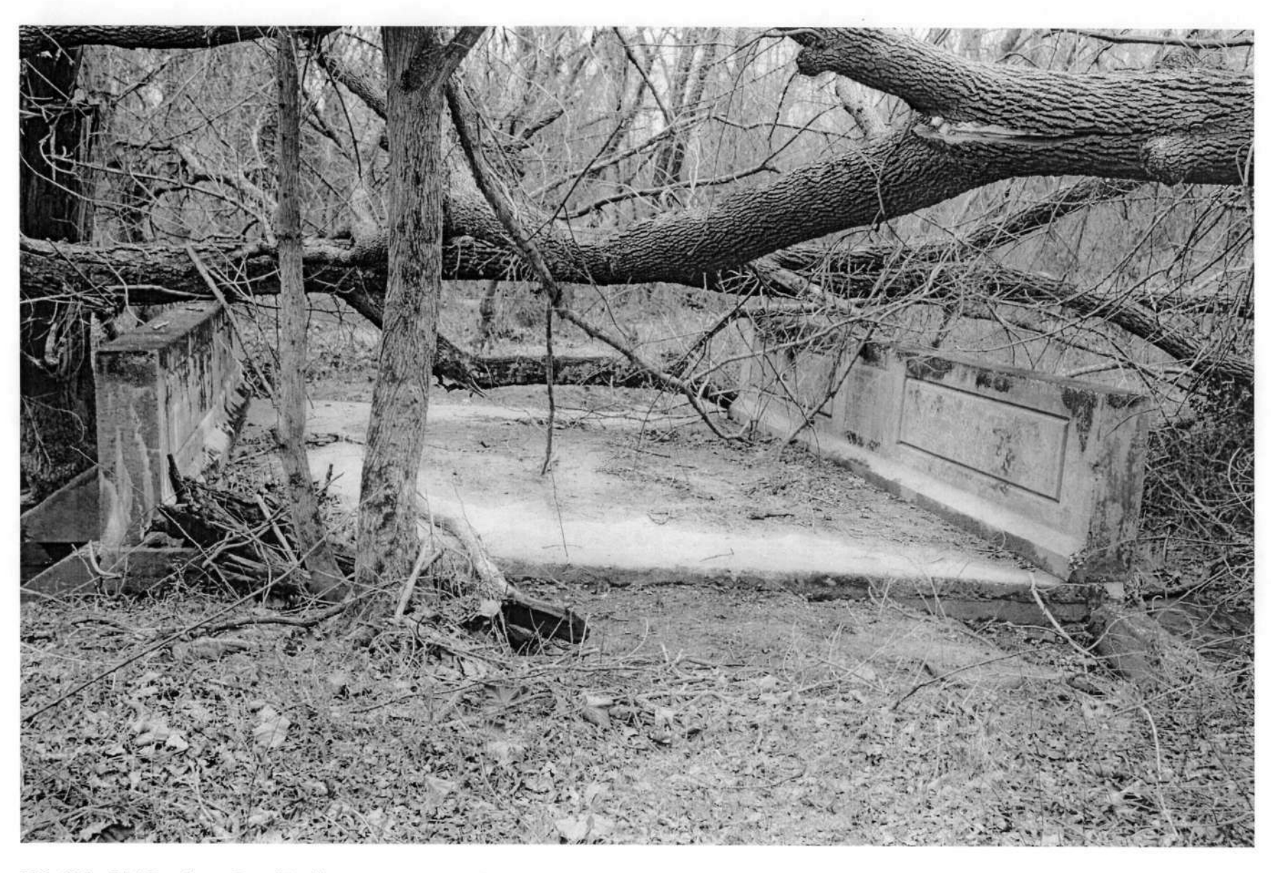
HO-932 Old Roxbury Road Bridge on East Branch View looking west Ken Short, December 2006 2/3