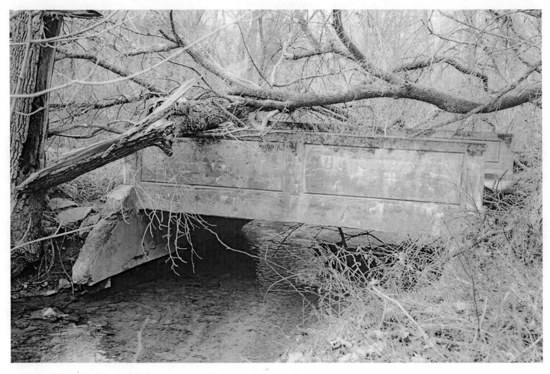
HO-932 Old Roxbury Road Bridge on East Branch View looking north Ken Short, December 2006 1/3