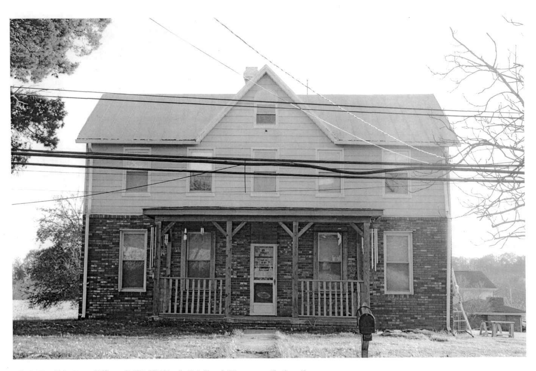
HO-927 Alpha Post Office 11995 Old Frederick Road House, north elevation Ken Short, November 2006 1/4