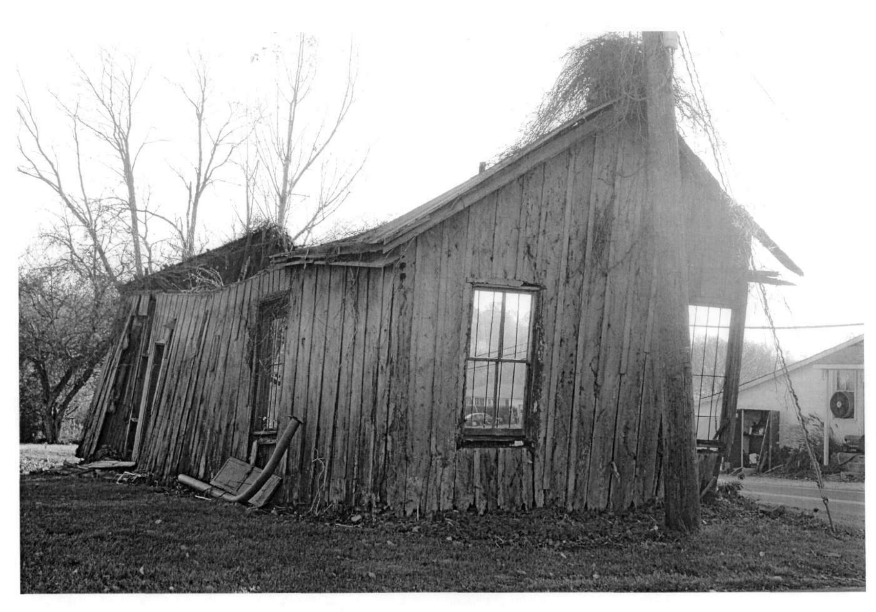
HO-927 Alpha Post Office 11995 Old Frederick Road Post office, east & north elevations Ken Short, November 2006 4/4