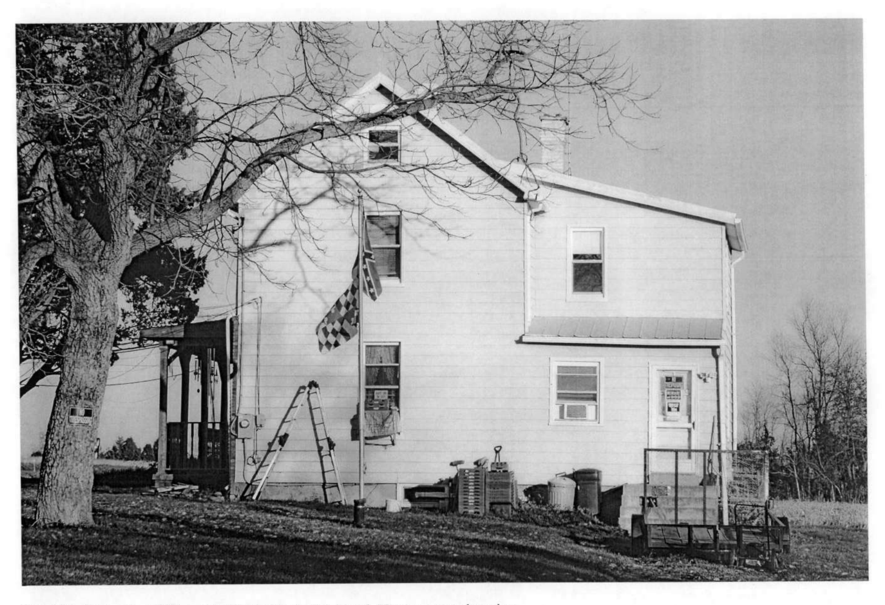
HO-927 Alpha Post Office 11995 Old Frederick Road House, west elevation Ken Short, November 2006 2/4