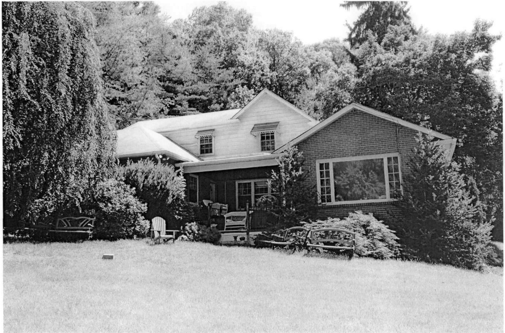
HO-926 Ken Short, June 2007 4/4