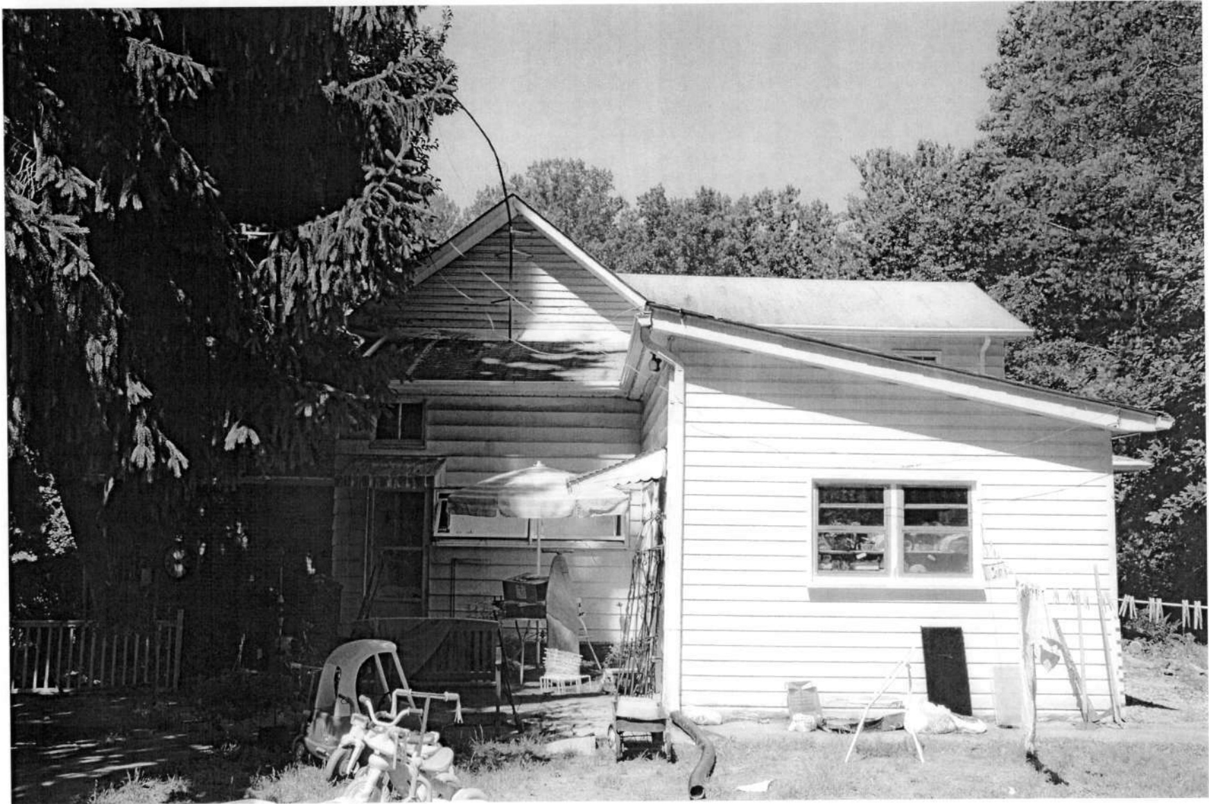
HO-926 Ken Short, June 2007 2/4