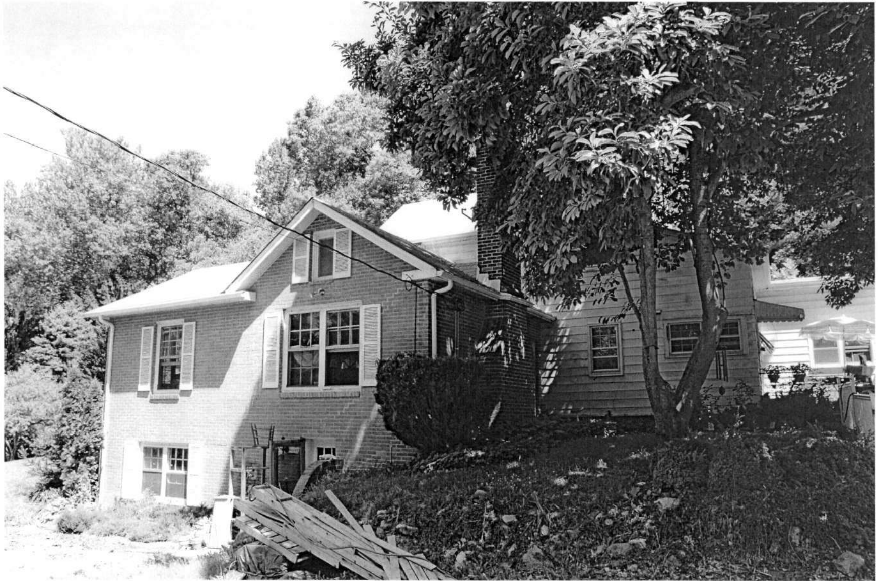
HO-926 Ken Short, June 2007 1/4