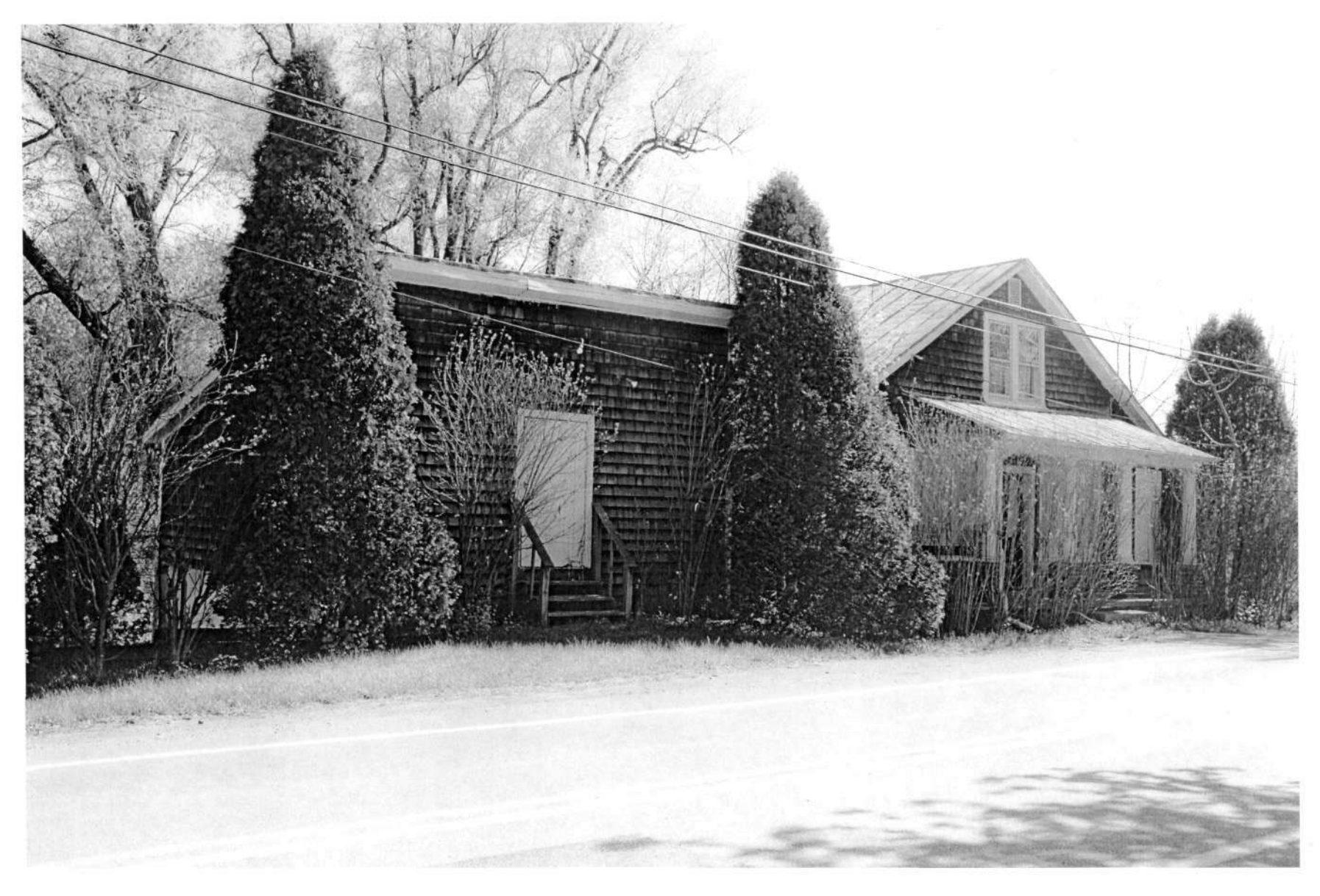
HO-925 Brown's Store and Post Office 14041 Triadelphia Road East & north elevations Ken Short, April 2006 \,1/3