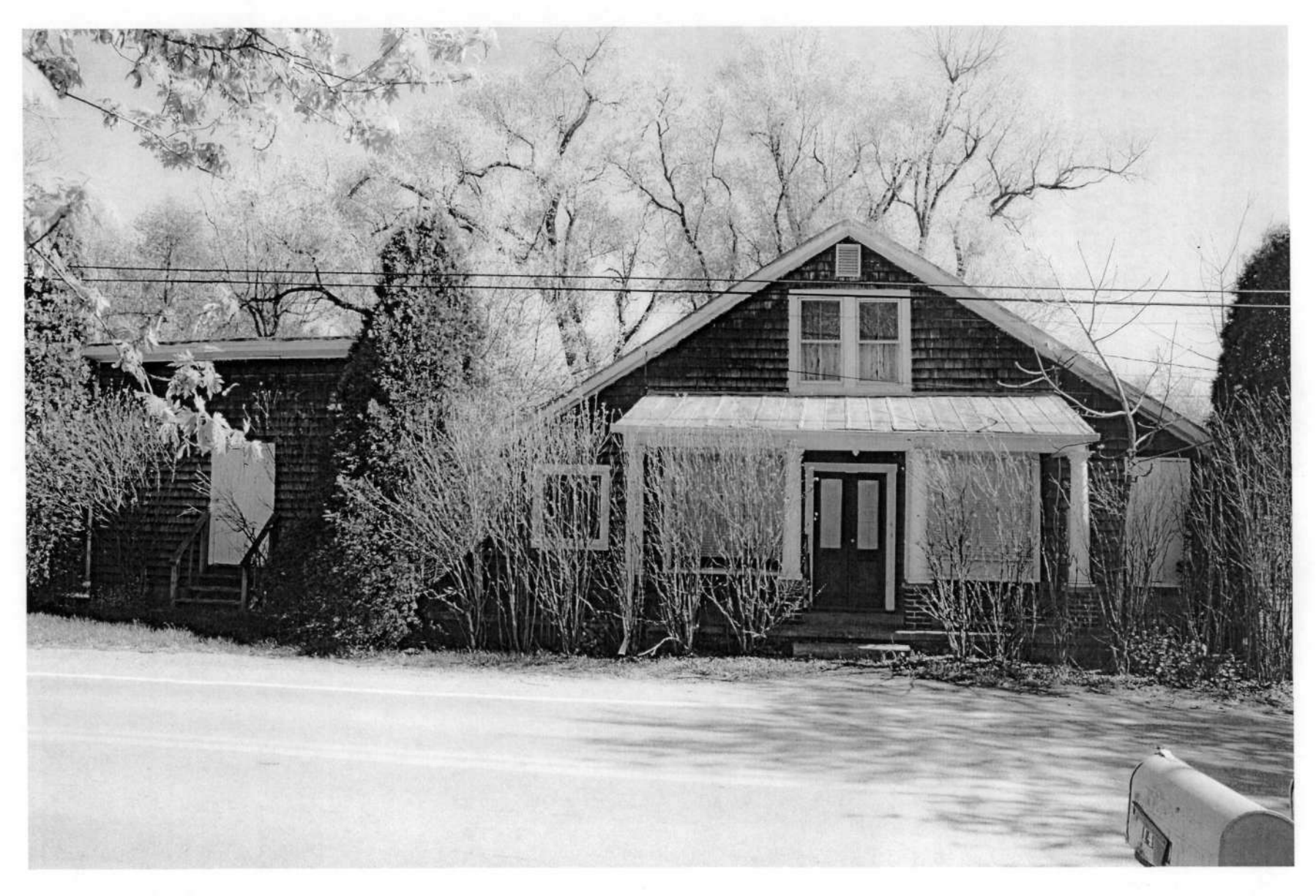
HO-925 Brown's Store and Post Office 14041 Triadelphia Road North elevation Ken Short, April 2006 2/3