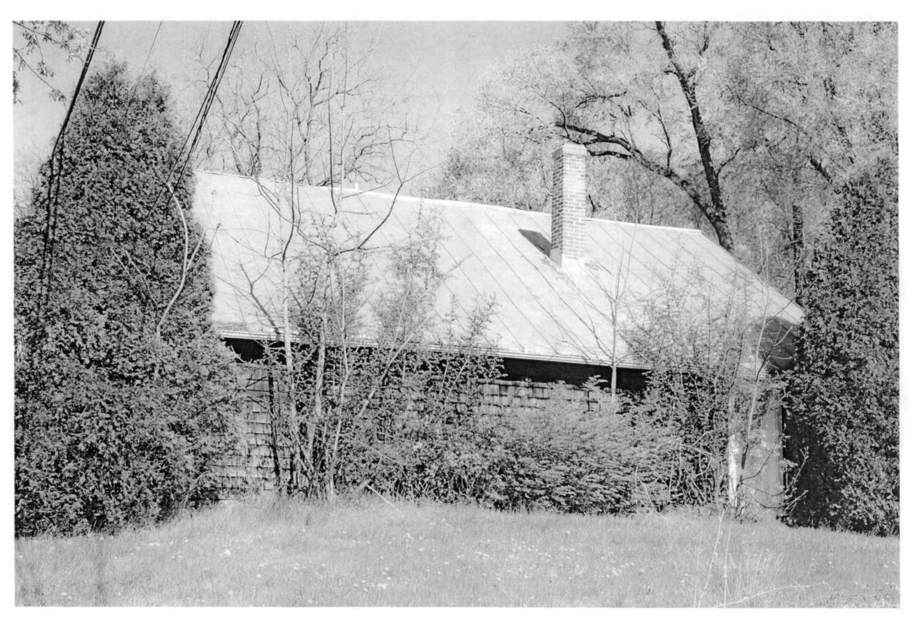
HO-925 Brown's Store and Post Office 14041 Triadelphia Road West elevation Ken Short, April 2006 3/3