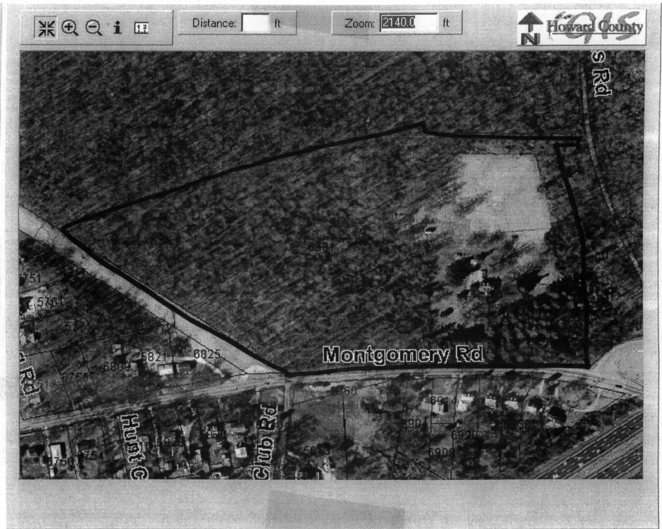
Daniel M. Murray, Jr. House (HO-885) 6831 Montgomery Road, Elkridge Howard County Site plan/Aerial photo