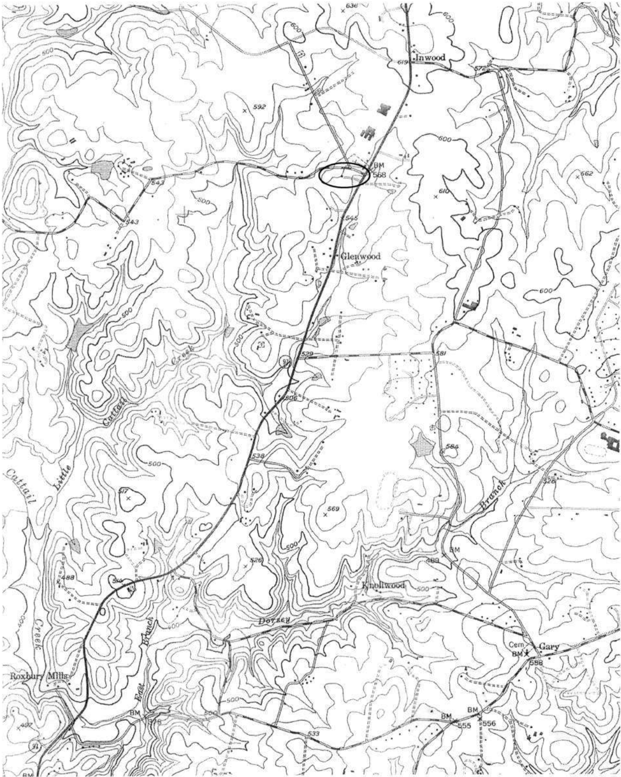
Alfred and Sophia Mathews Farmhouse HO-850 2888 Route 97, Glenwood Howard County USGS Woodbine Quad 1:24 000