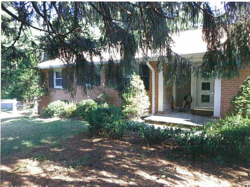
LEFT FRONT VIEW