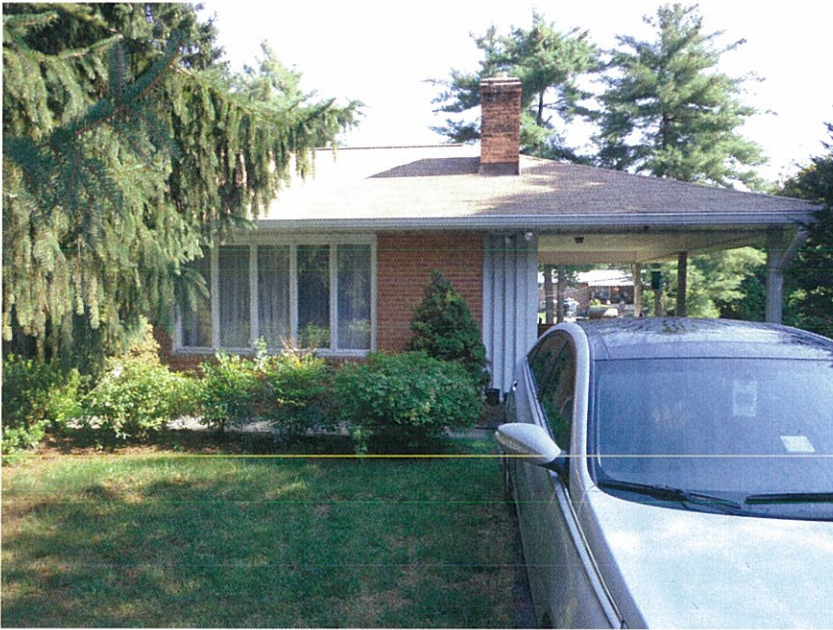
RIGHT FRONT VIEW