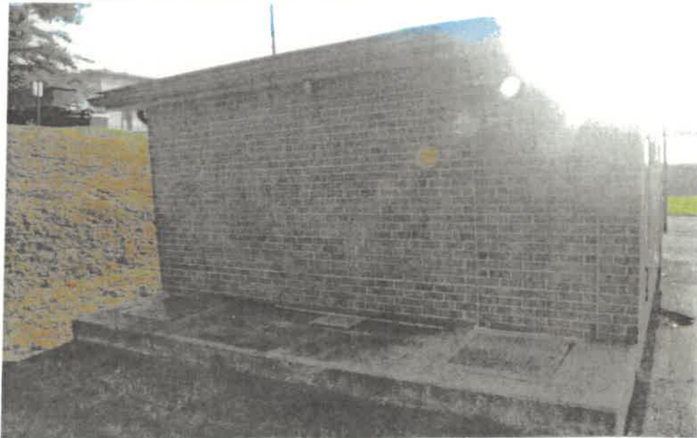
Photo Four Caption: Left side view taken 09-6-2023