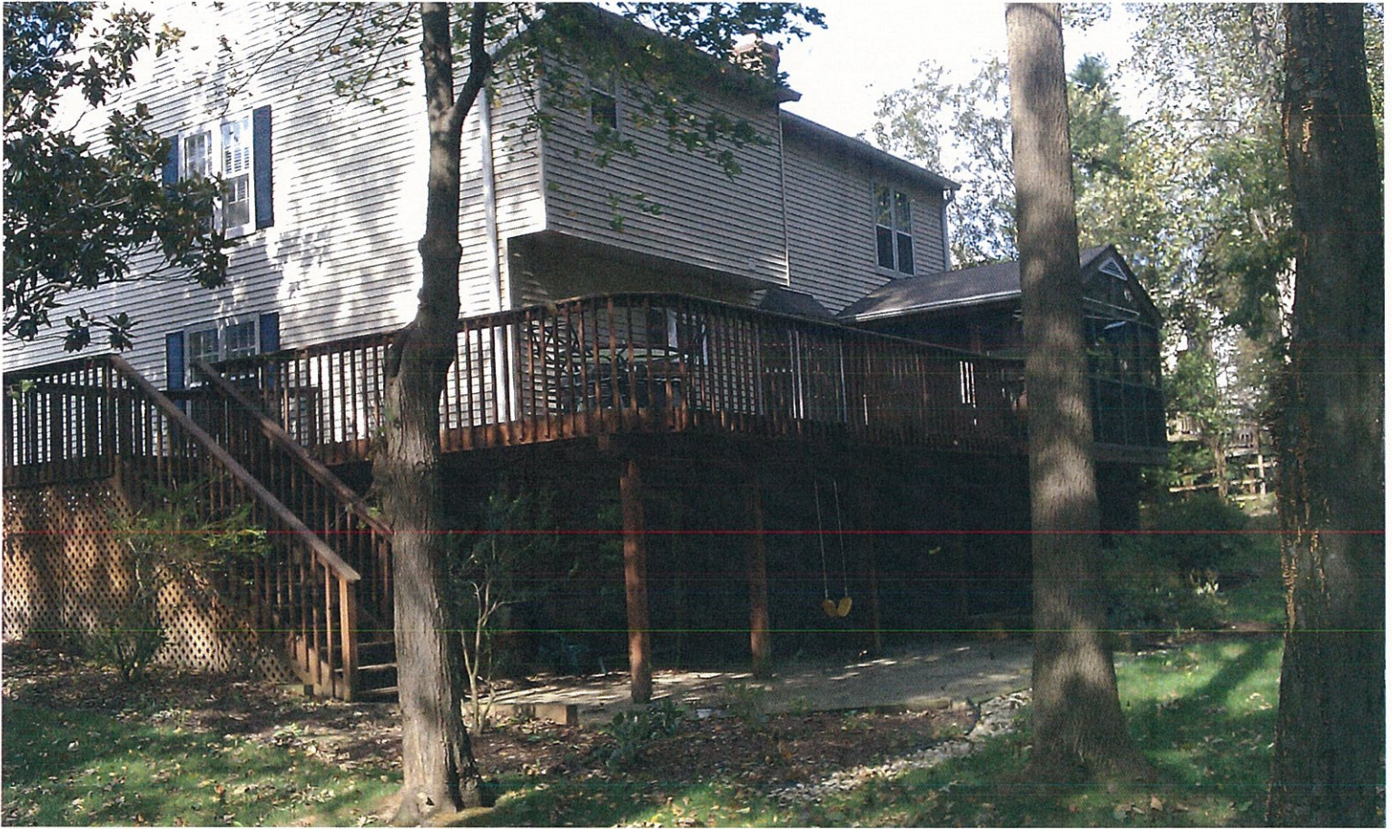
REAR/RIGHT SIDE VIEW