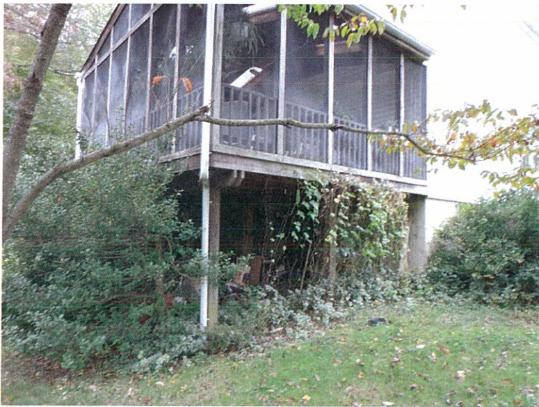
LEFT REAR VIEW