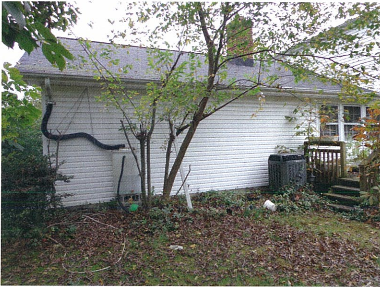
RIGHT REAR VIEW